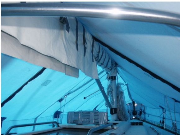
In Boom Furler