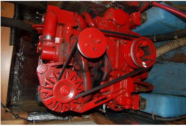
Westerbeke 421 hrs