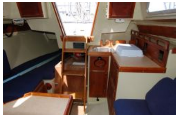
Main Cabin Aft