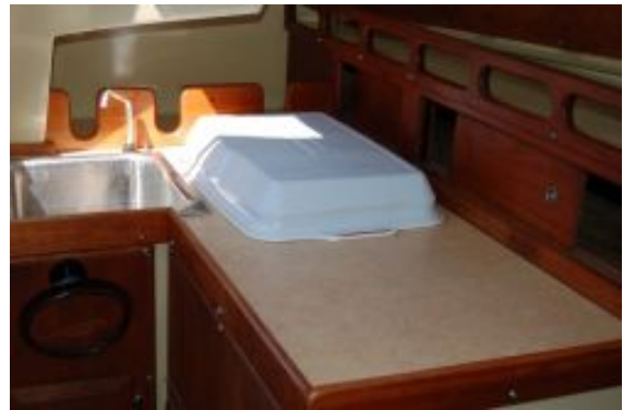
Improved Ice Box