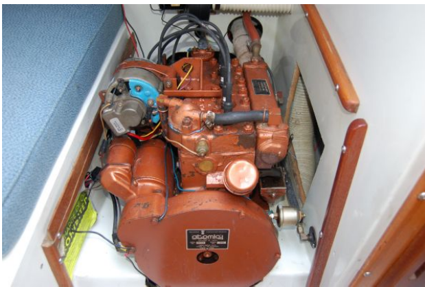
Very Clean Atomic 4